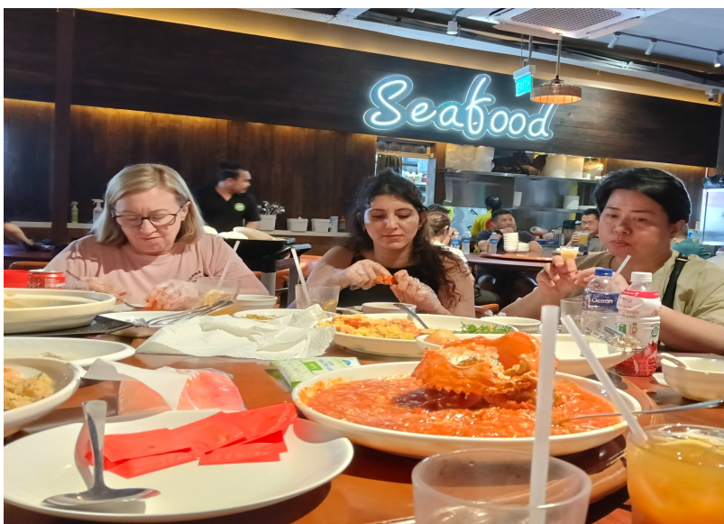
Singapore Hawker Street Food