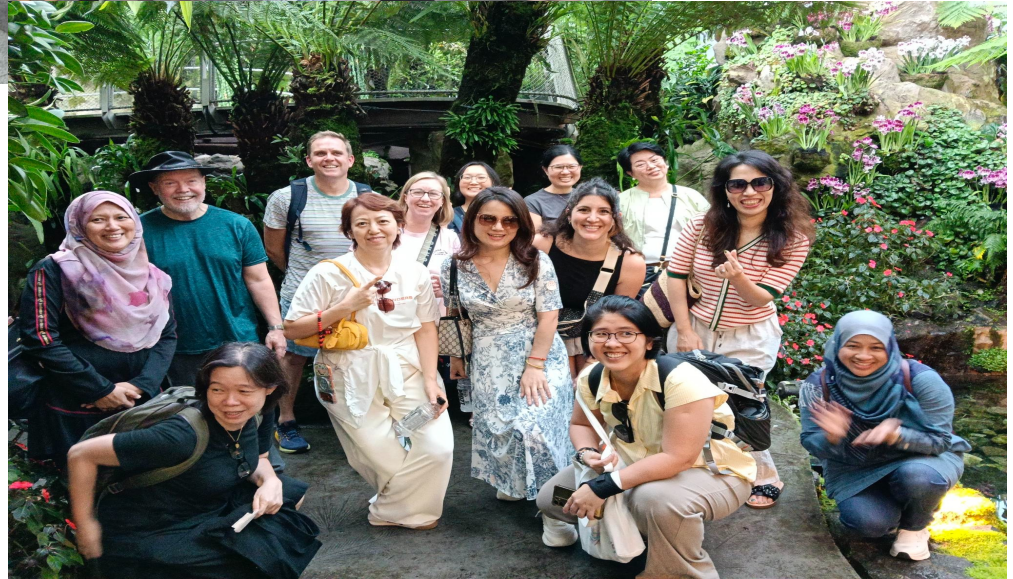
Singapore Botanical Gardens